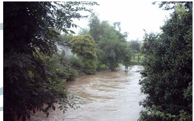
Maarkebeek bankfull flow

Flooding seems to occur more frequently and may result in severe problems in the downstream catchment area. It is clearly identified that this direct hydrological impact in the upstream catchment induces severe stresses for the downstream river flow control.