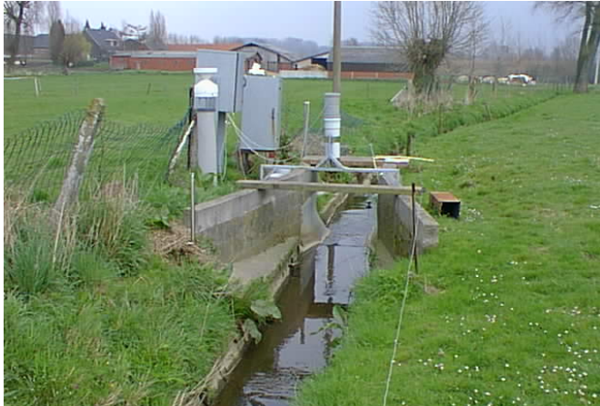
Field records along the Maarkebeek

Based on an intensive inventory of the actual state of the catchment, all relevant pressures and potentials are identified in the river basin. A calibrated (and validated) numerical river flow model of the actual status was developed, based on intensive field recording of water flow and stages.