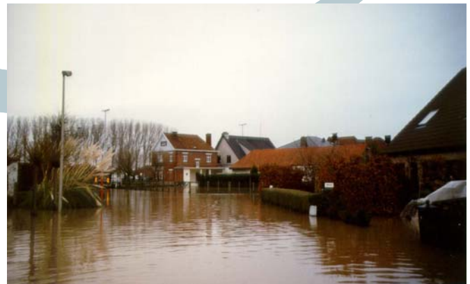
Flooding in Oudenaarde (1999)

During the storm of December 1999 several square kilometres were flooded, including important parts of the urbanised net of the City of Oudenaarde.