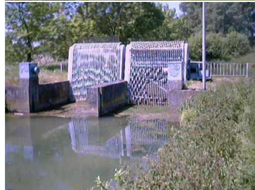
Impressions of structures implemented in the hydraulic ISIS model