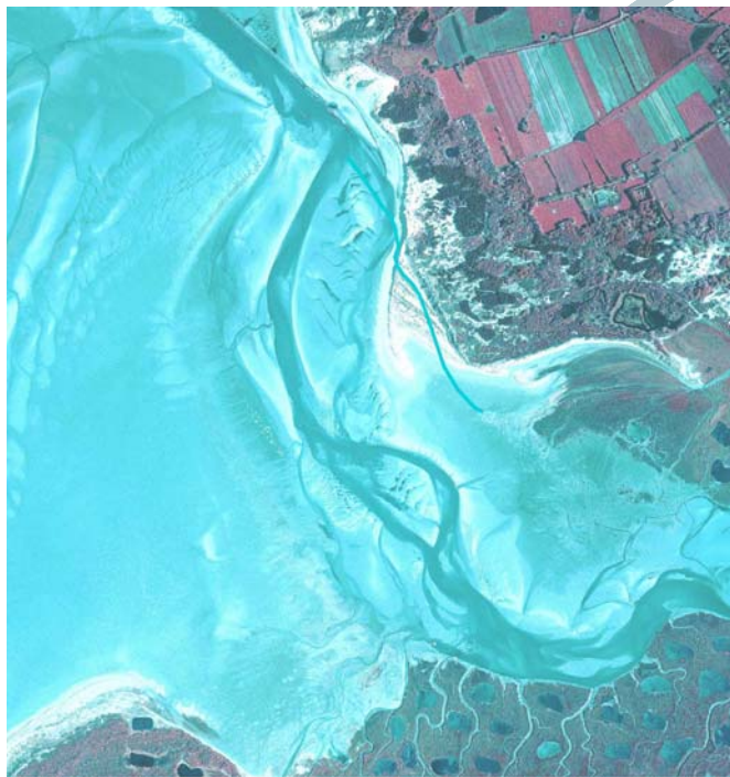
Satellite image of the Authie estuary

From the GIS database, a clear identification, quantification and visualisation of both potentials and threats were possible and publicly available ("visual") for each coastal management unit.