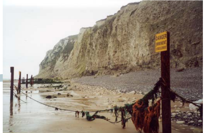
Cliffs at Cap Blanc Nez

In order to quantify the hydro- and morphodynamic features of the coastal zone, numerical modelling was used to calculate the flooding risks and associated coastal defence levels. Statistically defined stresses on the coastal stretch were combined with the identified coastal defence properties and the hinterland characteristics in order to quantify the risk level for each coastal management unit. From this risk evaluation, together with the future development perspectives, proper management measures were formulated in an integrated (taking into account technological, ecological, urban and/or socio-economical topics) management plan for the studied coastal area.