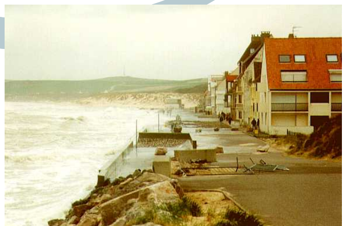
Sea wall in Wissant during storm

In order to quantify the hydro- and morphodynamic features of the coastal zone, numerical modelling was used to calculate the flooding risks and associated coastal defence levels. Statistically defined stresses on the coastal stretch were combined with the identified coastal defence properties and the hinterland characteristics in order to quantify the risk level for each coastal management unit. From this risk evaluation, together with the future development perspectives, proper management measures were formulated in an integrated (taking into account technological, ecological, urban and/or socio-economical topics) management plan for the studied coastal area.